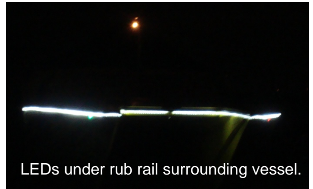
LEDs under rub rail surrounding vessel.

The U.S. Coast Guard is concerned about the sale and availability of unapproved recreational and commercial vessel navigation lights. Purchasers of such lighting should be aware replacement lighting may be improper for its application due to the failure by manufacturers to meet technical certification requirements. Furthermore, technical advances in marine lighting, such as the use of Light Emitting Diodes (LEDs), rope lighting, underwater lighting, and other various types of decorative lighting, may violate navigation light provisions of the Nautical Rules of the Road.